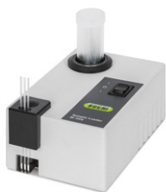
Sample Loader M-569 Efficient packing of capillaries