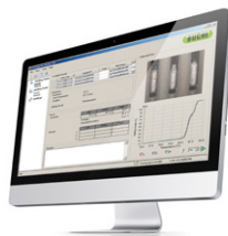
Melting Point Monitor Software Data management software