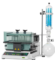
Syncore® Polyvap Multiple sample workup