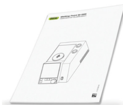
IQ / OQ for M-565 Qualification procedures