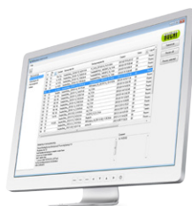
NIRAnywhere Software Network solution