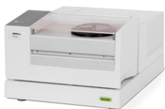
NIRFlex® N-500 Versatile laboratory FT-NIR spectrometer