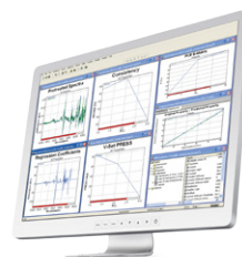
NIRCal® Software Chemometric calibration development