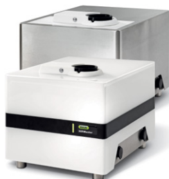
NIRMaster™ IP54 / Pro IP65 FT-NIR spectroscopy