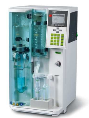
Figure 3: KjelFlex K-360 with SO2 absorption vessel