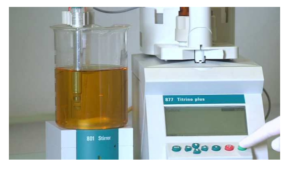
Figure 6: Titration setup with Pt-electrode