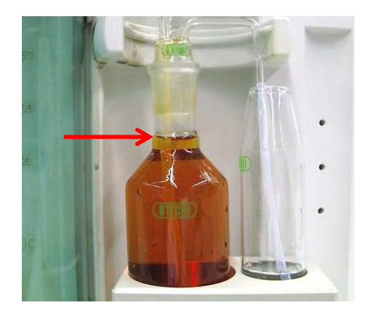
Figure 5: 1st receiver filled with destillat to the bottle neck

The distillation process is stopped as soon as the distillate in the 1<sup>st</sup> receiver is filled up to the neck of the bottle (approx. 5:30 - 7 minutes). Distillation time is expected to be longer for liquid samples with high water content than for solid samples. The distillation volume has to be identical for all the samples in the series.