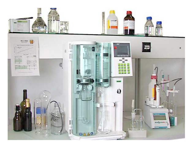
Figure 1: Setup for SO2 determination

This shows that the patented BUCHI SO_2 method performs within the repeatability and reproducibility