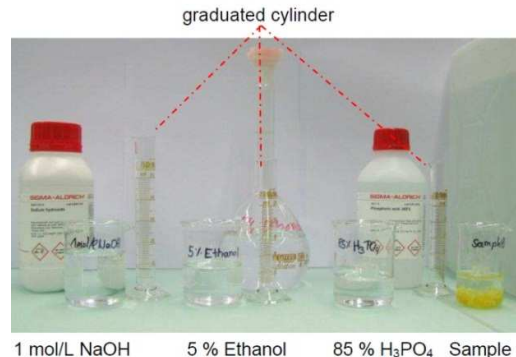
Those Nach 5 % Ethanol 65 % H3PO4 Sample

This method is designed to overcome the various problems found in the International Organization of Vine and Wine (OIV-18) method without compromising on results.