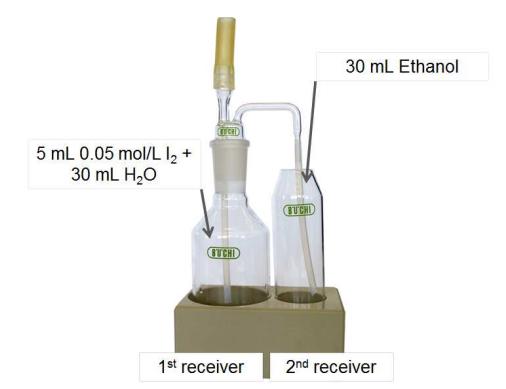
Figure 4: SO2 absorption vessel

The SO_2 absorption vessels are connected to the condenser outlet of the distillation unit