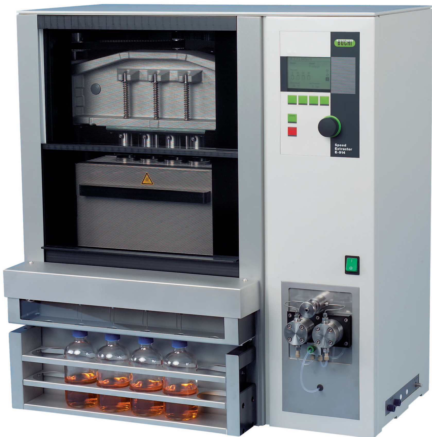
Fig. 1: SpeedExtractor

PCDD/Fs, dioxin-like PCBs and non dioxin-like PCBs were extracted from fish samples with different fat content: eel (> 30%) and trout (~ 4%). In addition, a fish sample from a round robin test was extracted as reference material (Interlaboratory Comparison on Dioxins in Food 2010, Folkehelseinstituttet, Oslo, Norway). The samples were disembowelled, boned, scaled, washed, freeze-dried and homogenized. 8 to 19 g (dependent of the fat content) were mixed with diatomaceous earth and extracted with di-chloromethane/ n -hexane (1:1/v:v). The extraction method of the SpeedExtractor E-914 is displayed in Table 1. Before extraction, 16 13 C 12 -labeled PCDD/F standards and 18 13 C 12 -labeled PCB standards were added to the sample material.