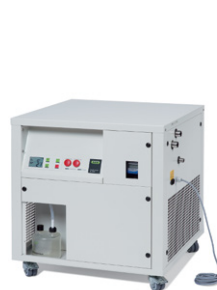
Inert Loop B-295

Spray Dryer for small samples and particles