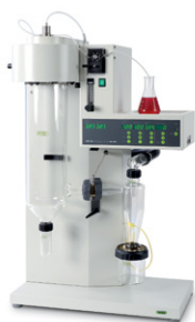
Mini Spray Dryer B-290